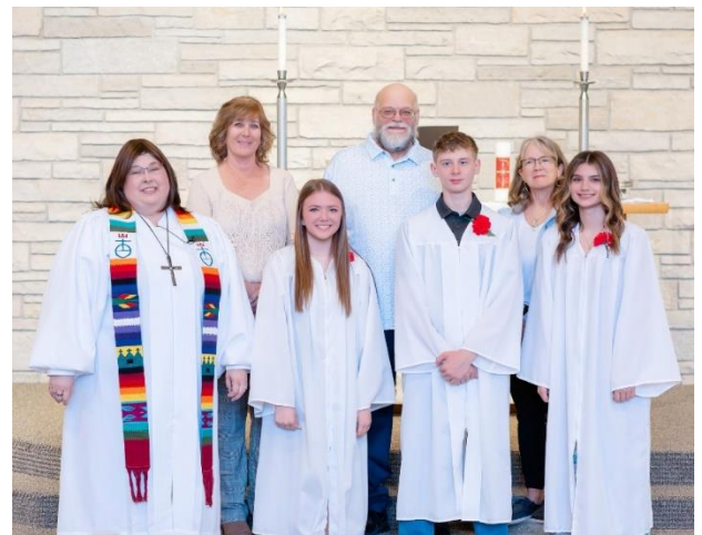
Confirmation May 2026