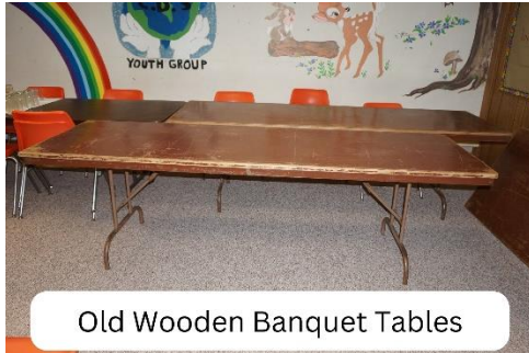
Old Wooden Banquet Tables

Please contact the church office if you are interested 715-743-2147 or check with Bob Petkovsek or Mike Perkl.