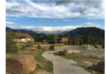
YMCA Camp at Estes Park. CO

I continue to wonder where God is calling us. And honestly, listening for the Spirit is not for your pastor to do alone. We need as a congregation to do that. What I also learned in listening to my colleagues and what we read in the book, is that we need to listen to the community where we live. What are our needs? What are our resources and with whom can we partner? We have some