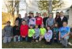
CD's & Confirmation Class Raking Leaves 1

Document and what was gleaned from the book will intersect. At this gathering we will discuss that intersection, who we are as a church and where we understand the Holy Spirit is leading us today. Everyone is invited and encouraged to attend.